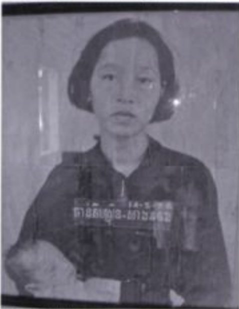
Victims at Ioul Seng prison

Unfortunately, in Cambodia, justice is hard to find and payoffs and corruption are the norm. The ECCC, as most ad hoc tribunals, has been set up as a political showpiece. The ECCC courtroom itself is in a theatre-like setting, with stadium seating for about 200. The audience sees the semi-circle court through huge floor-to-ceiling glass and