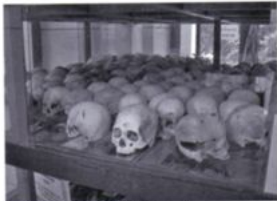
Skulls of young female victims at Choeung Ek

First, a little history. From April 1975 until January 1979, the ultra-Communist Khmer Rouge regime controlled all of Cambodia. It was then